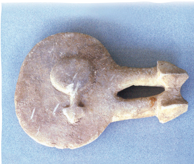
Headed idol with disk shaped body from Kültepe. This idol symbolised a sacred family (mother, father, and child) marble. (Early Bronze Age III. Kayseri Museum)