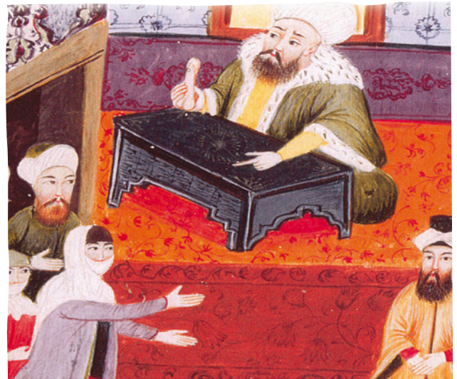
The woman who wants her right to have a proper husband. (Hamse-i Atai, Turkish-Islamic Art Museum, Number, 1969,102a)