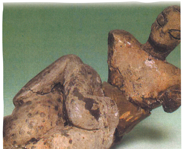
One of the first sexual scene in the world. Upper part of the body of a young god was broken. (Hacilar, Late Neolithic period, 5600 B.C. Baked Clay H: 11,4 cm Museum of Anatolian Civilisations, Ankara)