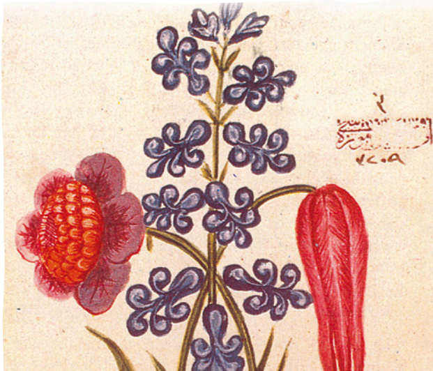
A bunch of flowers, with a symbolic drooping tulip, in the Hamse-i Atai. It is colored in the eighteenth century Turkish miniature style called edirnekârî (Turkish-Islamic Works Museum, Istanbul. Hamse-i Atai. No. 1969, f.55a)